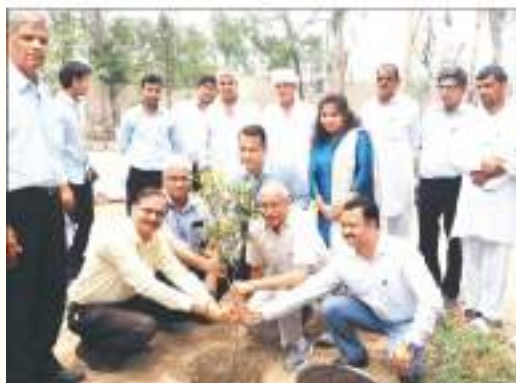
हमारे पास बहुत सारे लोग हैं जो हमारे साथ हैं।