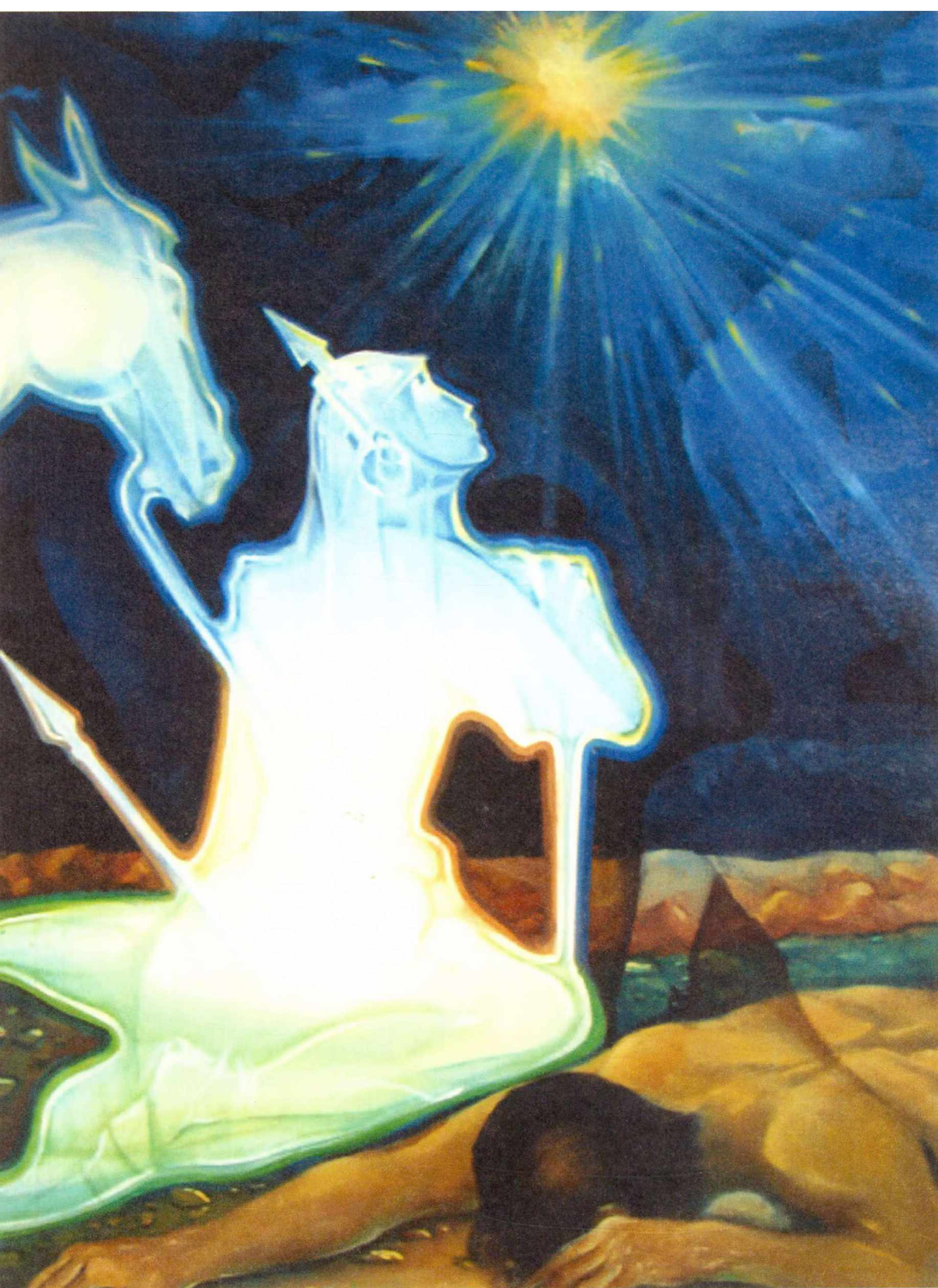
The Warrior of light has learned that it is best to follow the light