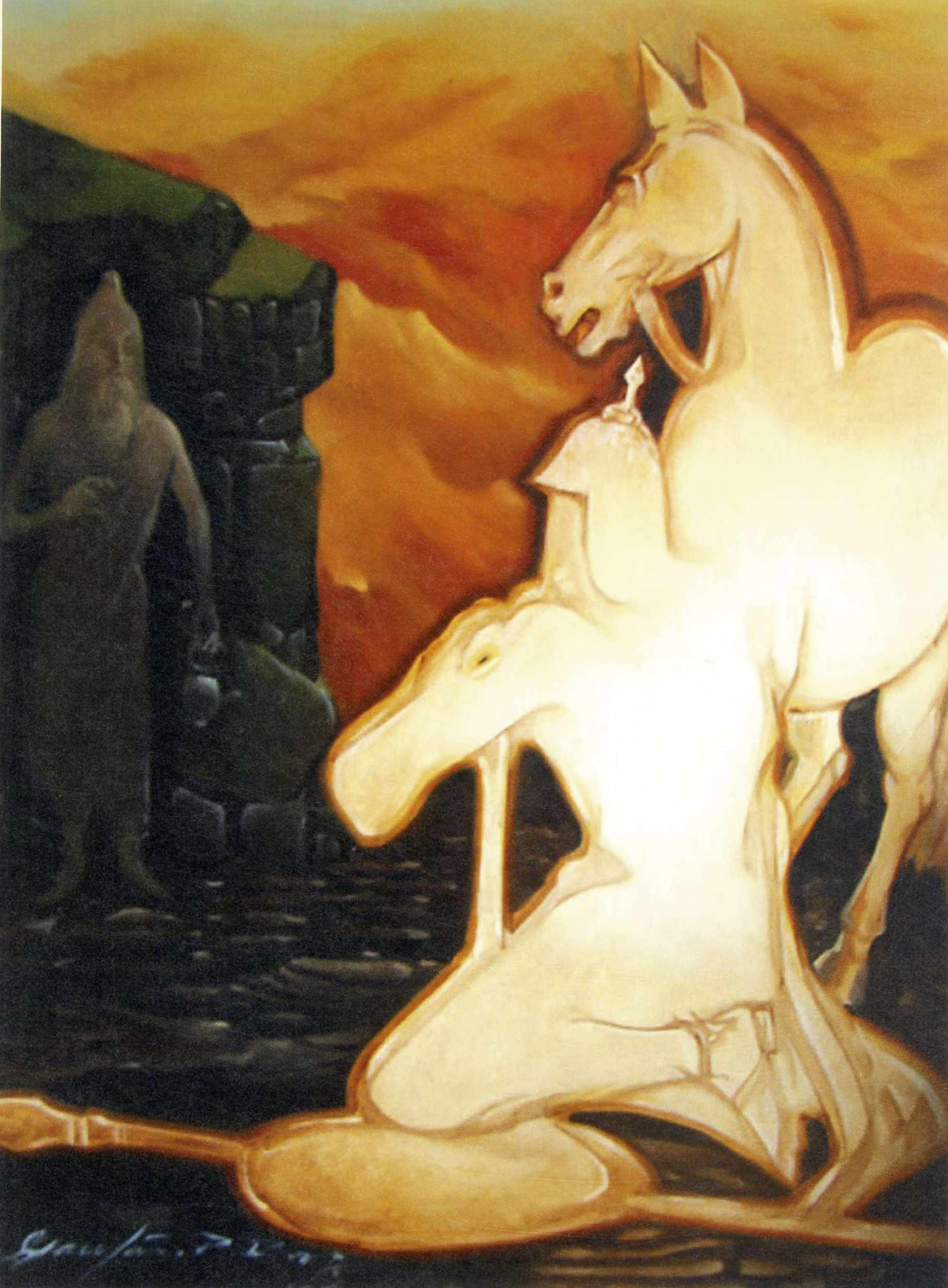
The Warrior of light listens