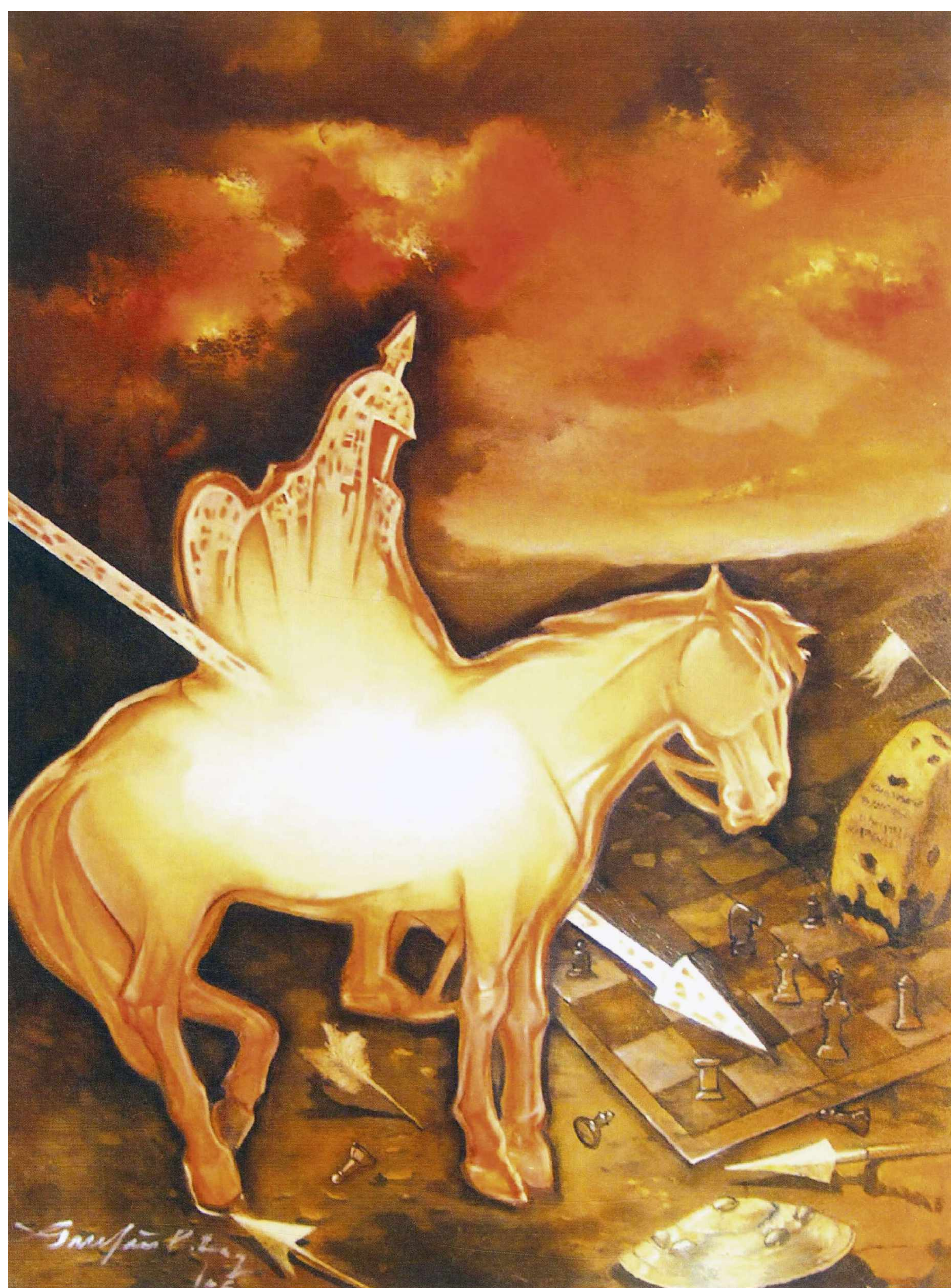
In the intervals between battles, the warrior rests