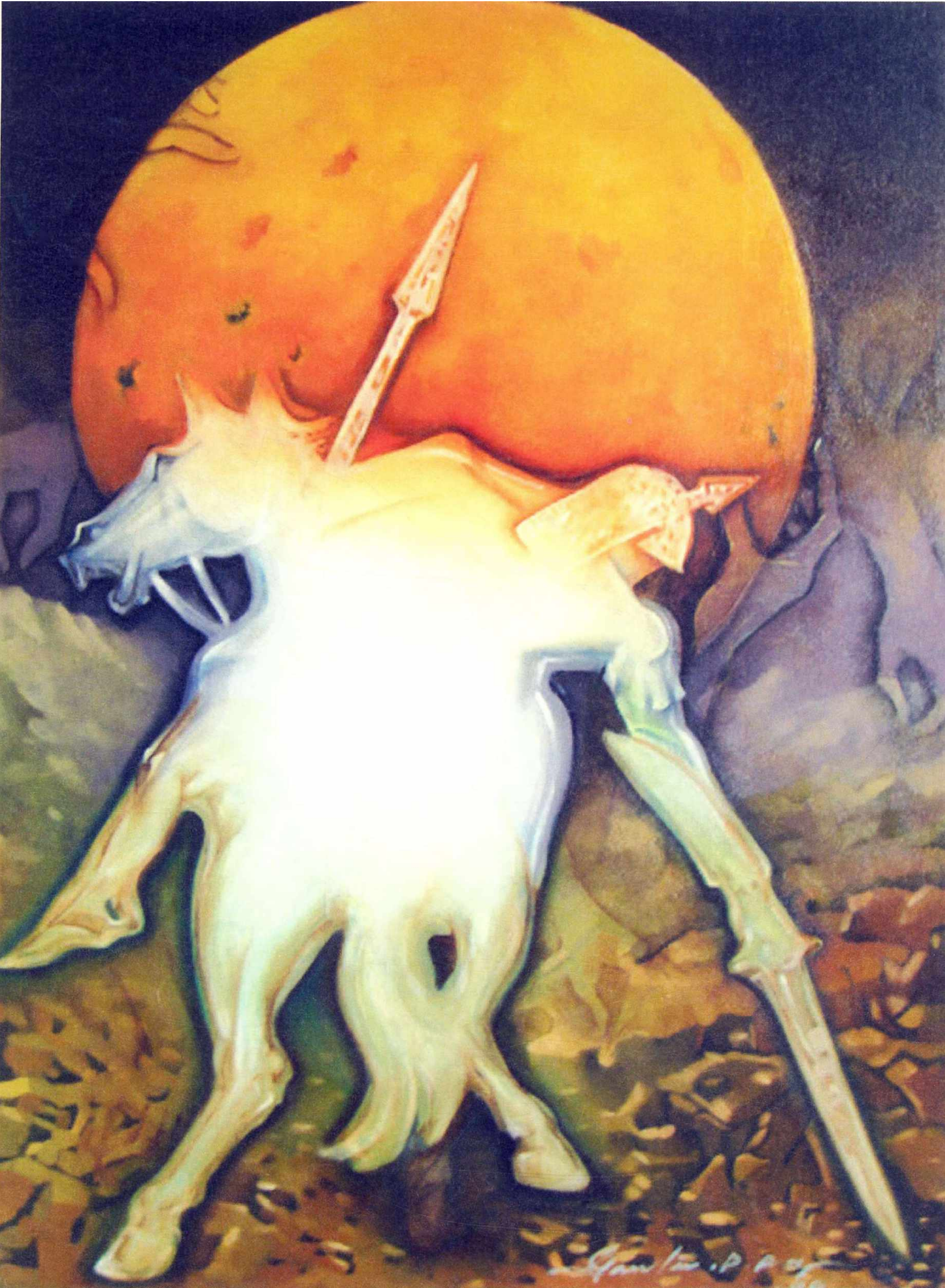
The way involves respect for all small and subtle things. Learn to recognise the right moment to adopt the necessary attitudes