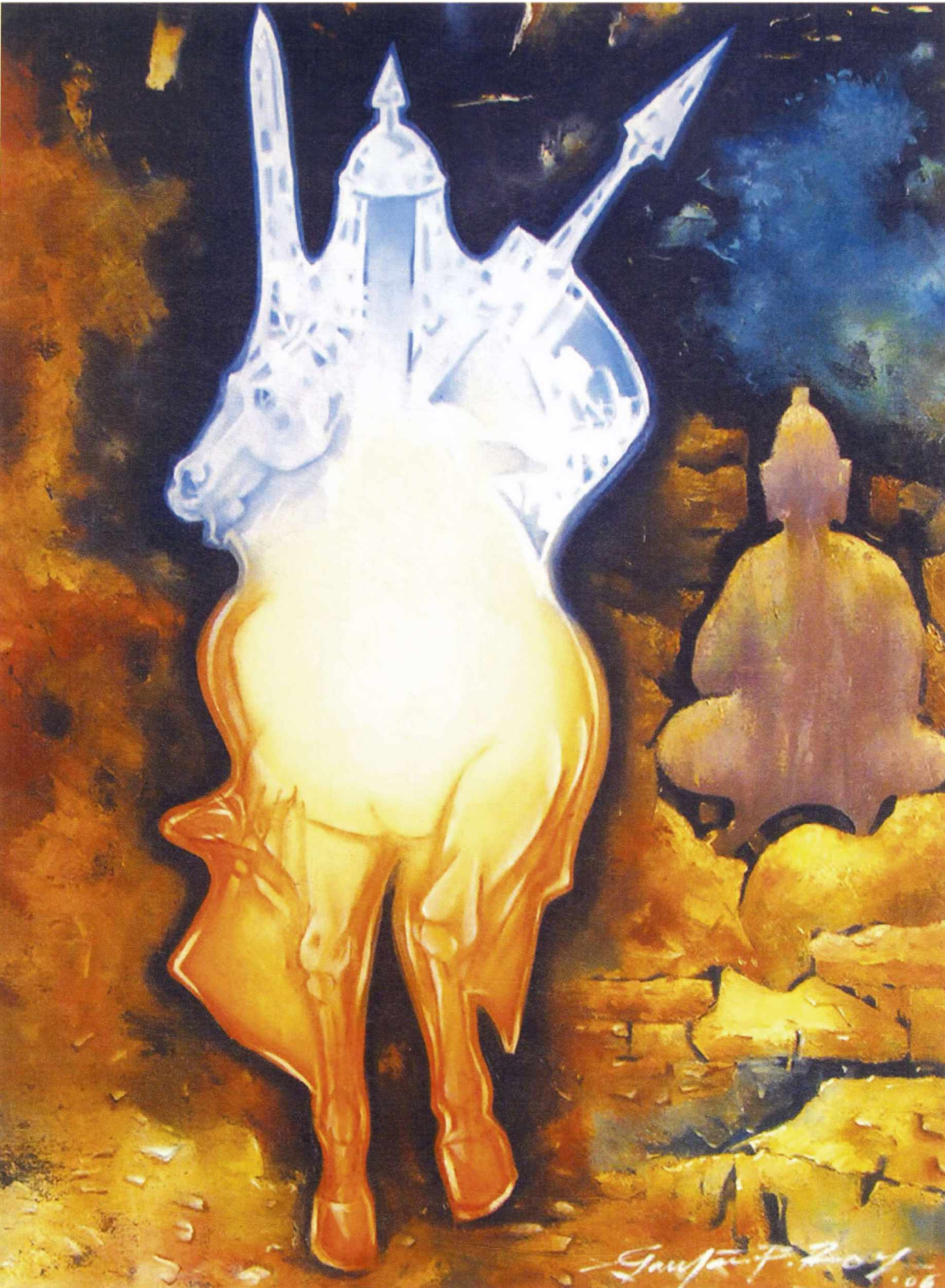
The Warrior of light has the qualities of a rock