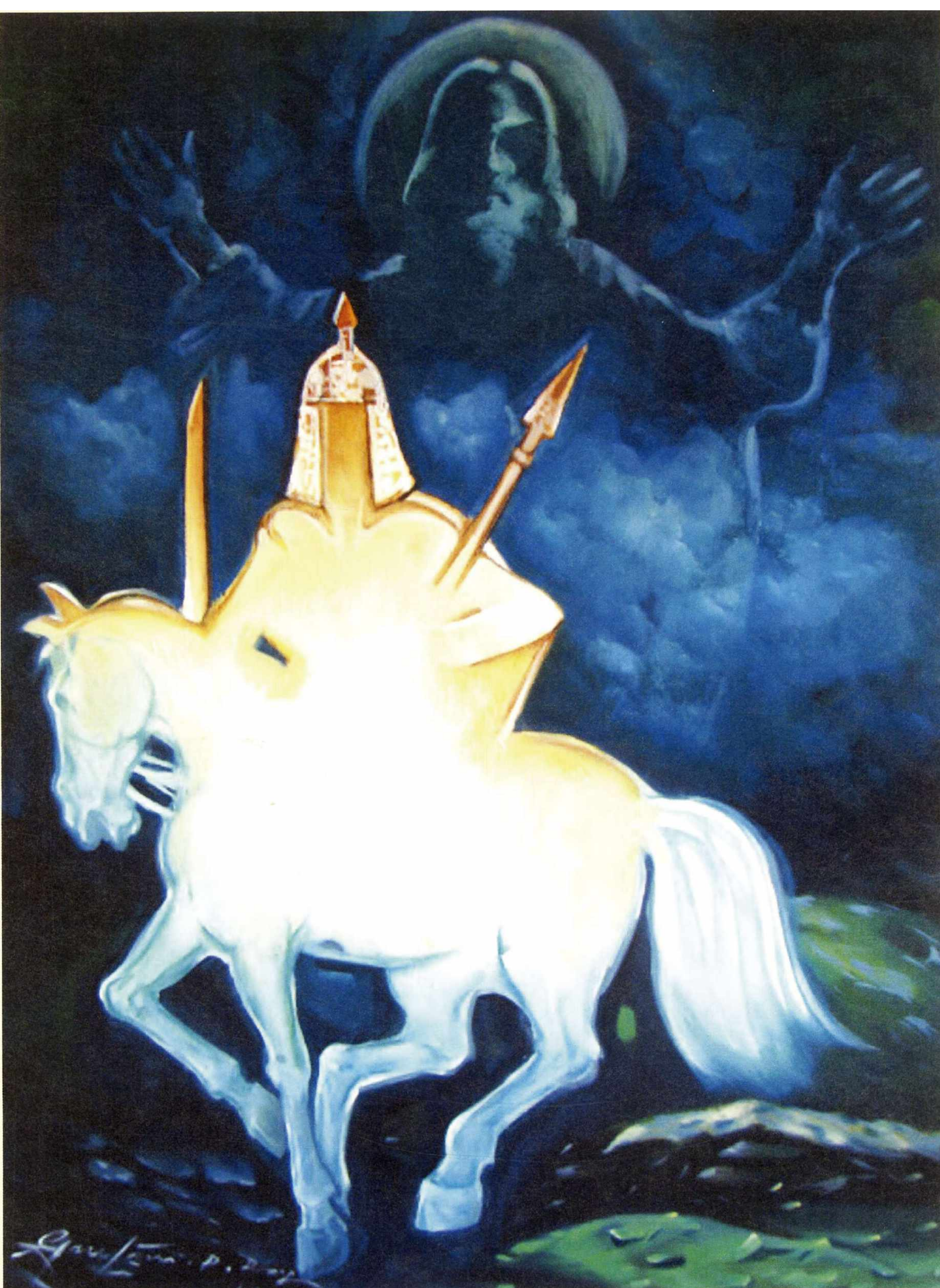
The Warrior of light does not always have faith