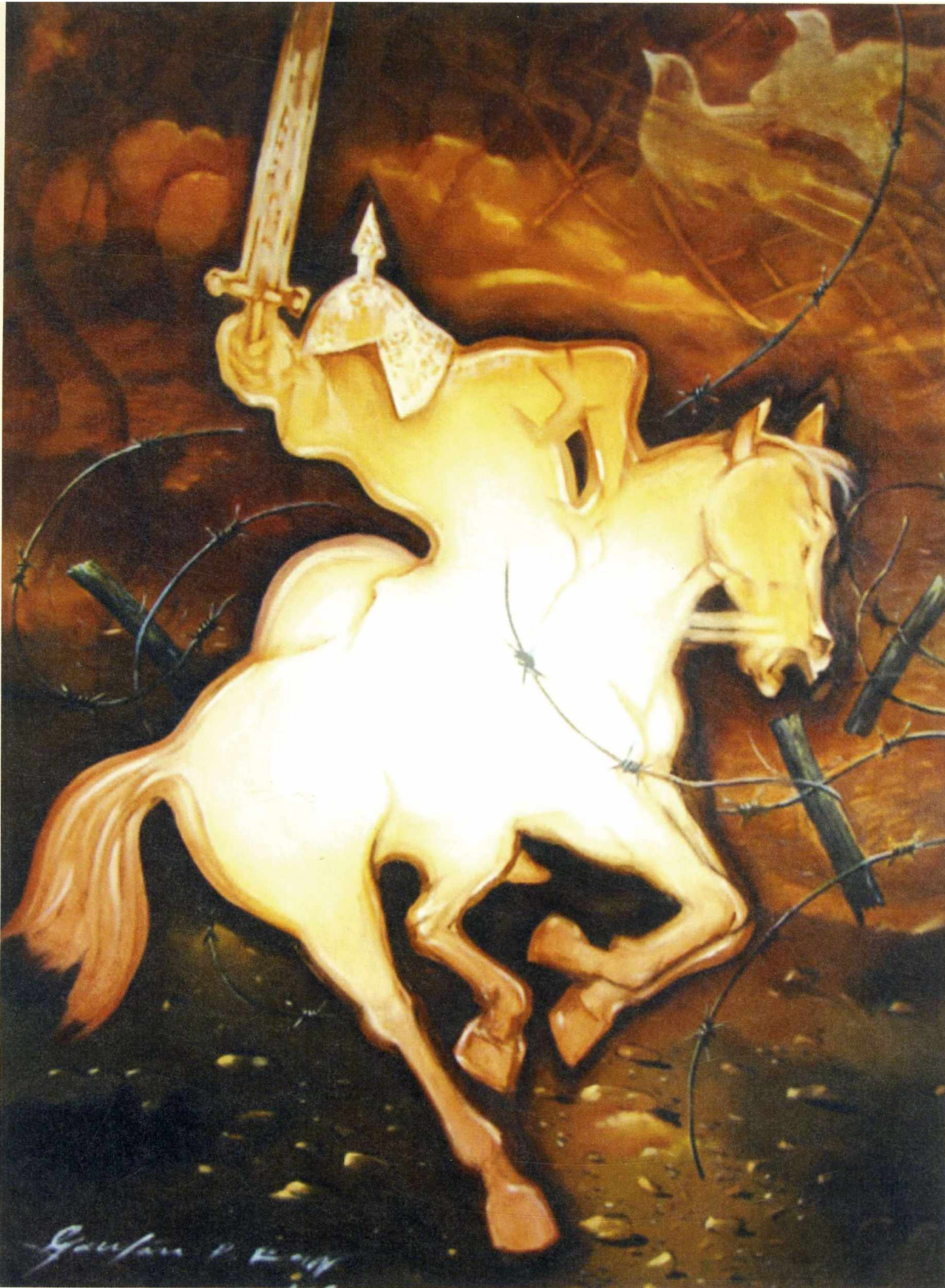
The Warrior of light never falls into the trap of the word freedom