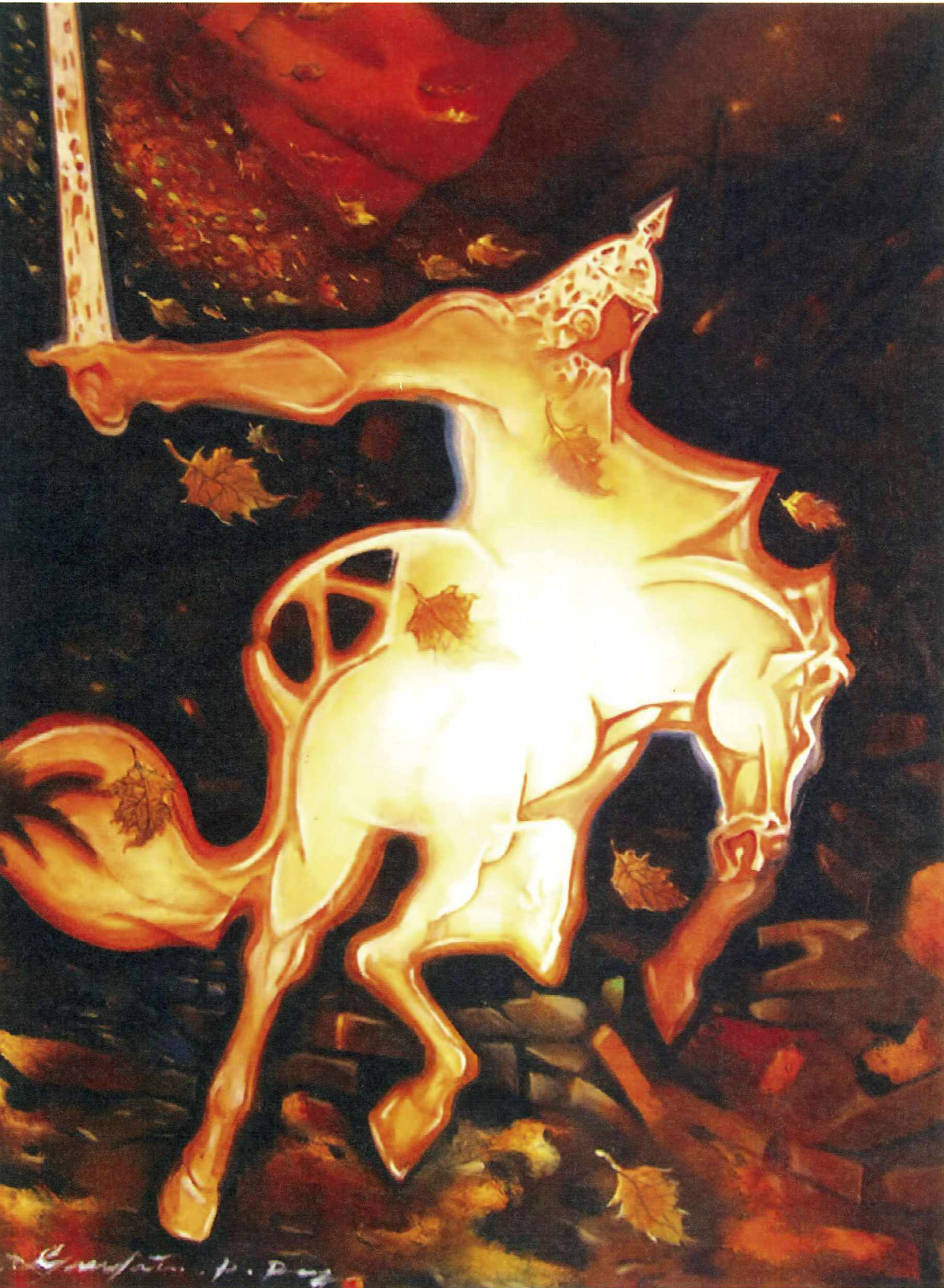
A Warrior simply has to accept the Challenge