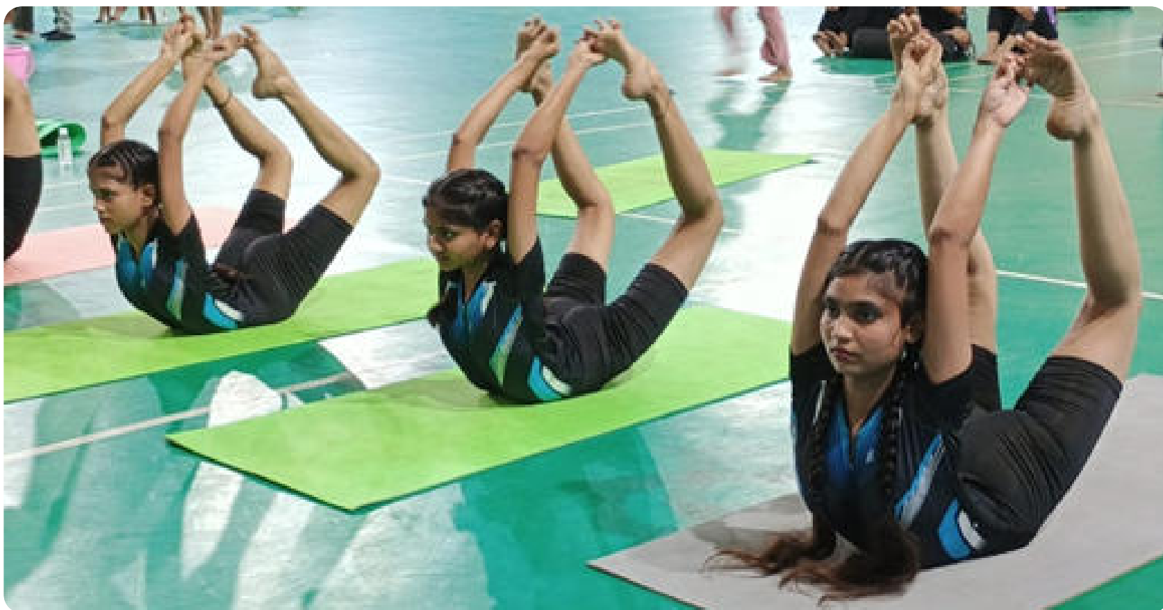
Students during the State-level Yoga Championship at Acharya Narendra Dev University of Agriculture and Technology, Ayodhya