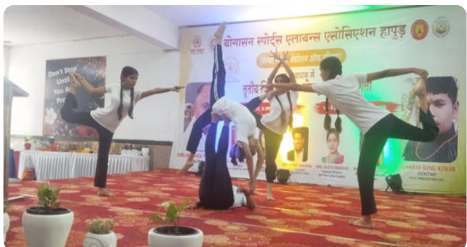
Students during the District Yoga Championship at JMS World School, Hapur

With this stellar performance, GAV secured an overall 2 nd position among all participating schools reflecting the dedication of students and the tireless efforts of their yoga instructors.