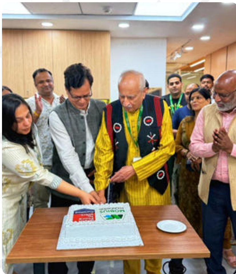
Glimpses from the inauguration