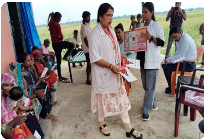
Glimpse from Family Planning Camp