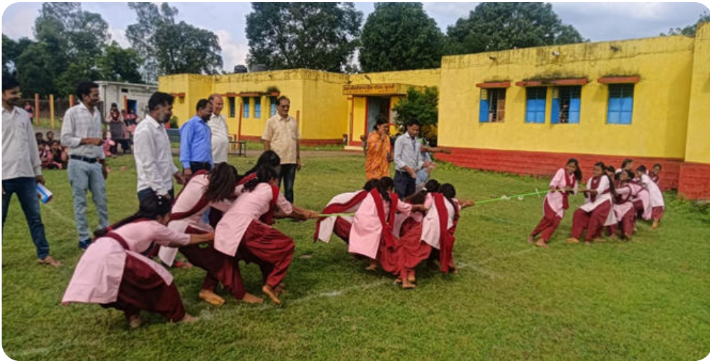
Students during National Sports Day Celebration