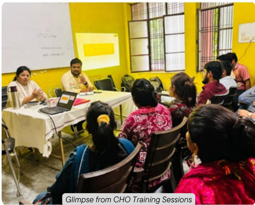
Glimpse from CHO Training Sessions