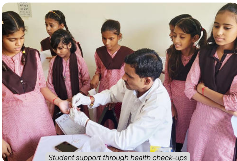
Student support through health check-ups