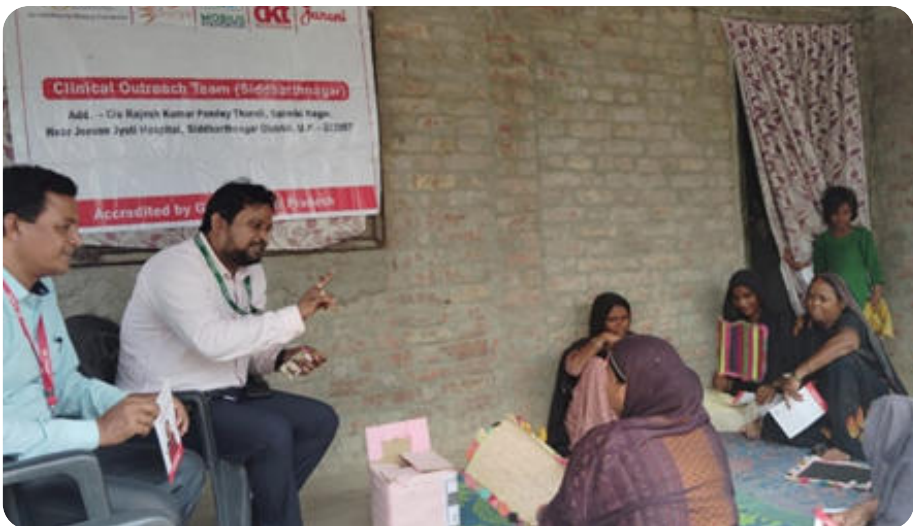
Interaction with ASHAs during community visit