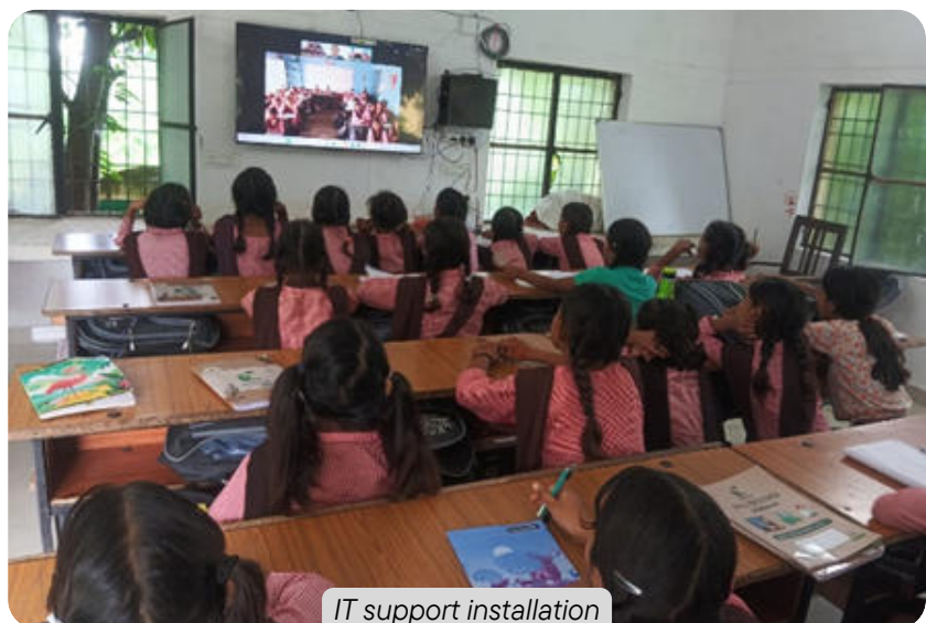
IT support installation

5. Aayojikas Onboarding & Orientation – Jhansi, Jalaun & Lalitpur: Newly appointed Aayojikas were formally welcomed, followed by an orientation to align them with program objectives.