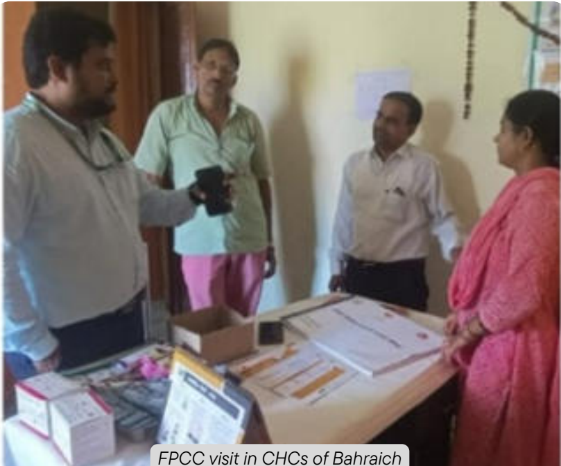
FPCC visit in CHCs of Bahraich